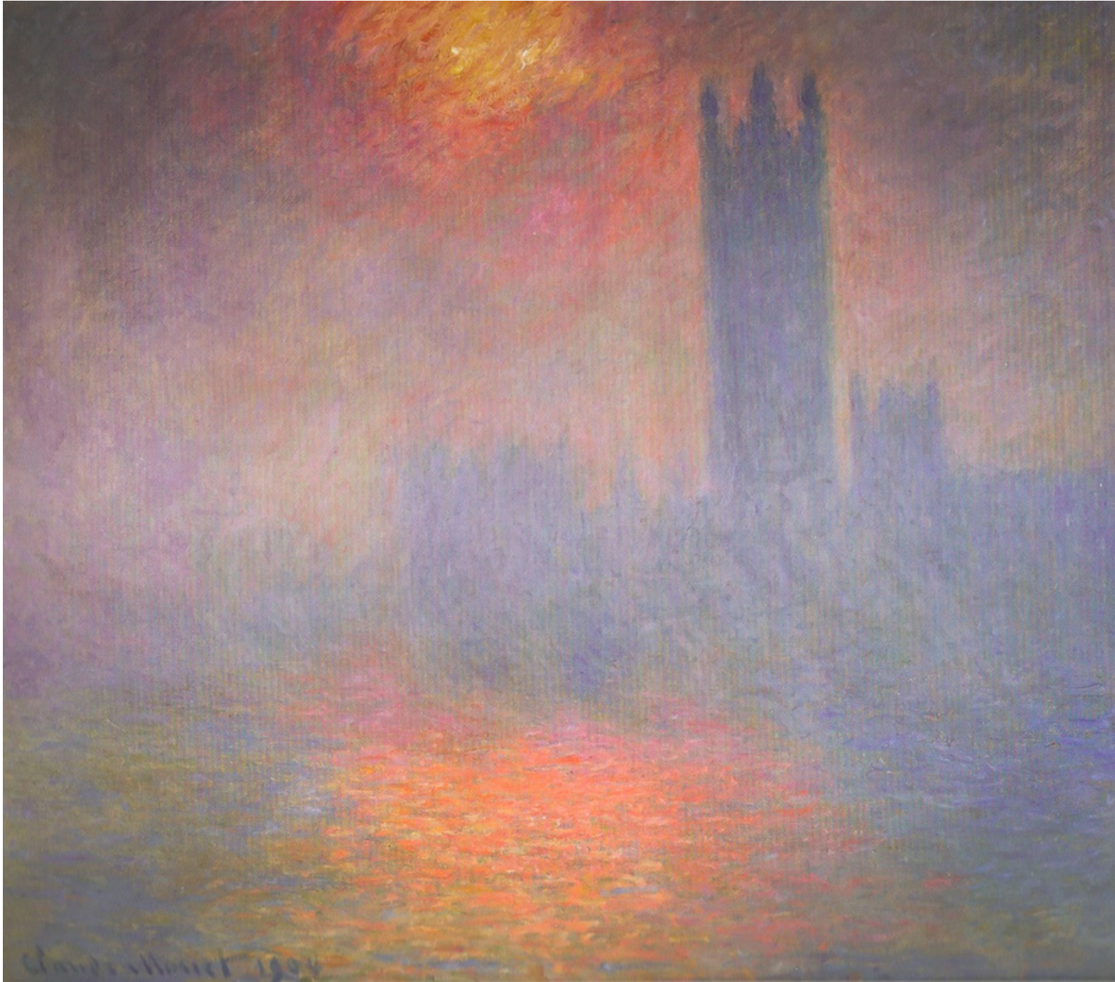
Houses of Parliament, Sunlight Opening in Fog, by Claude Monet 1904