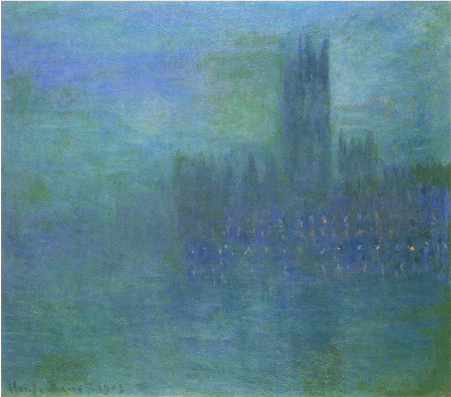
Houses of Parliament, Fog Effect II, by Claude Monet 1903