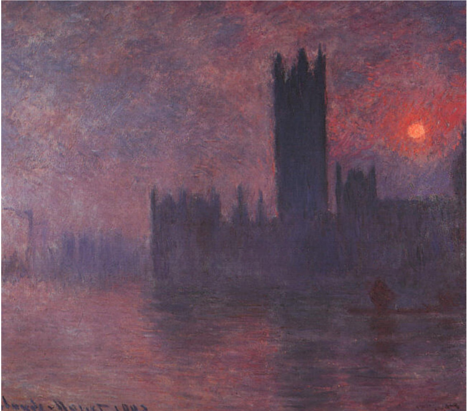
Houses of Parliament, Sunset, by Claude Monet 1903