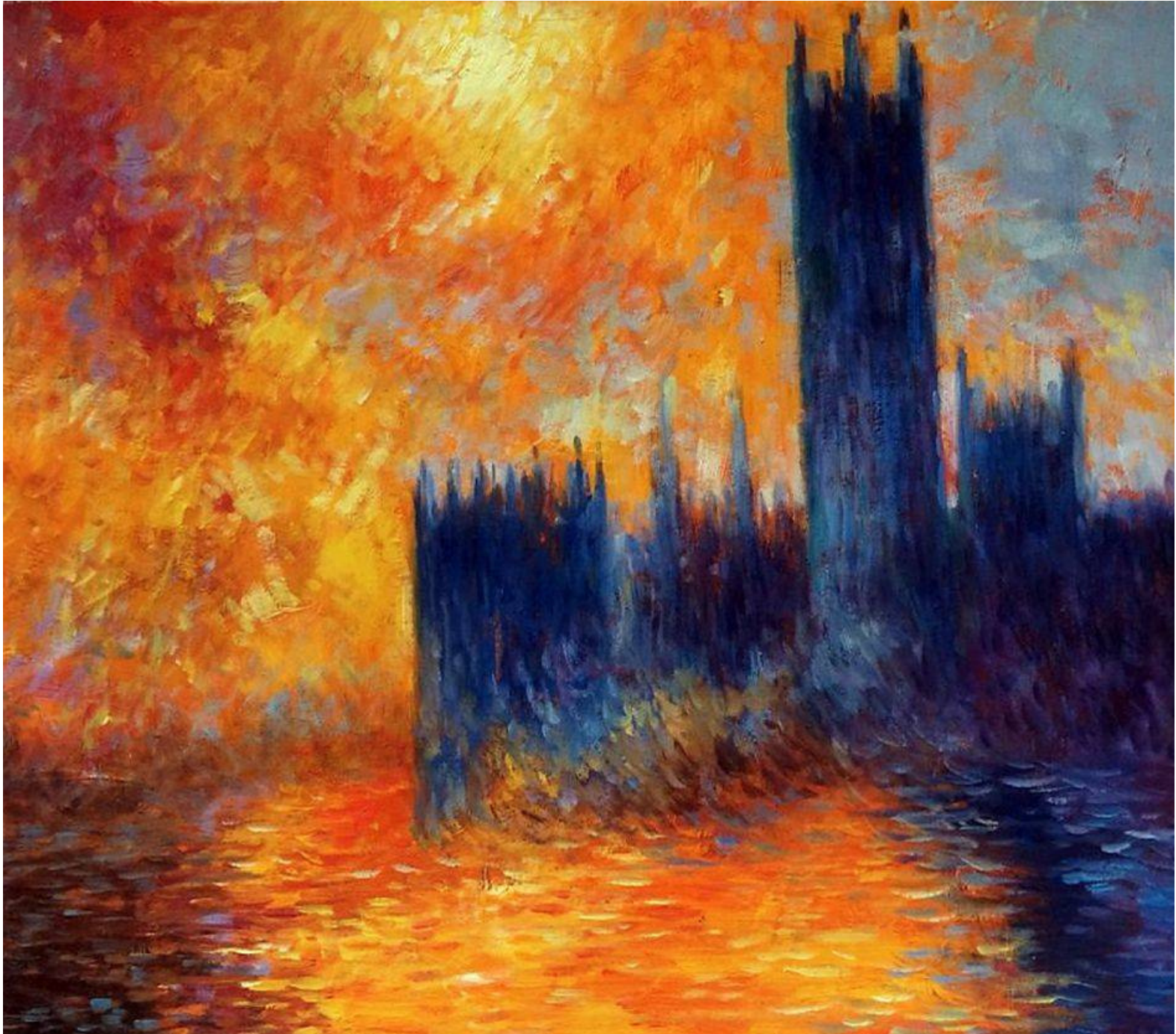
Houses of Parliament, Sun, by Claude Monet 1903